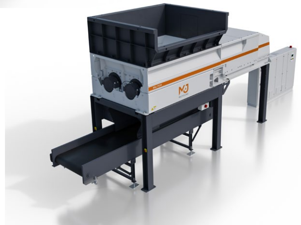
Version with E-drive