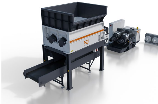
Version with hydraulic drive