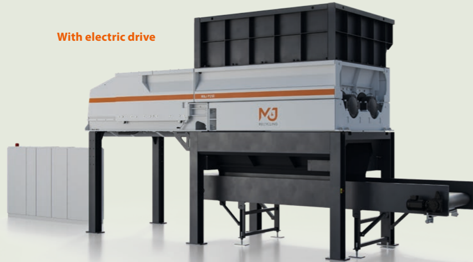
With electric drive