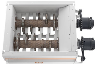
Cutting table 5 knives