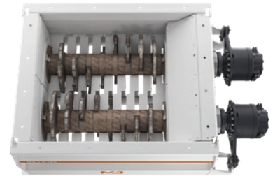
Cutting table 8 knives