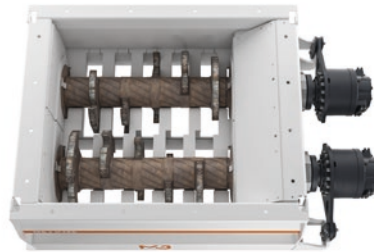
Cutting table 5 knives